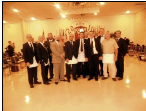
Grand Masters One Day Class