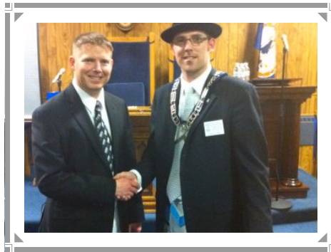
Called Communication January 26, 2012 ( Master Mason Degree)