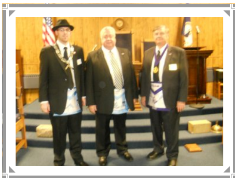
February 02, 2012 Stated Communication