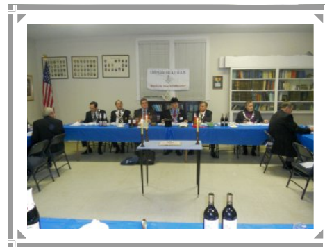
February 16, 2012 Stated Communication

90th Anniversary of Cherrydale Lodge Celebration Table Lodge 2012