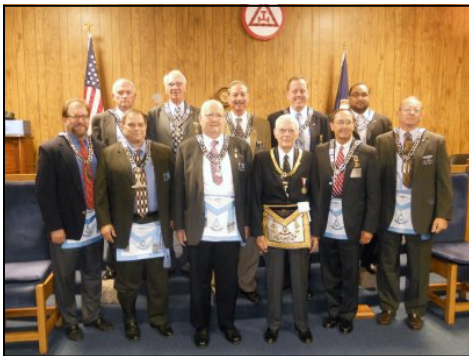
Past Masters Night at Cherrydale Lodge - Stated Communication June 07, 2012