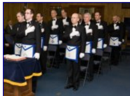
Installation of Cherrydale Officers 2012