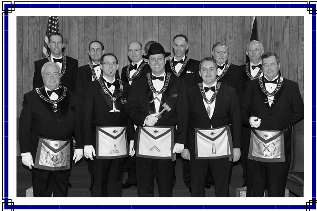
Cherrydale Lodge Officers—2011